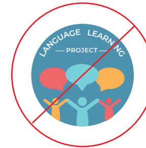
DON'T change the colors as they are used in the logo

To preserve the integrity of the Language Learning Project's logo, only the configurations and colors referenced in these guidelines are permitted. Do not create new configurations or use new colors. And be mindful of how the logo appears on colored or dark backgrounds to maximize contrast and allow the logo to stand out.