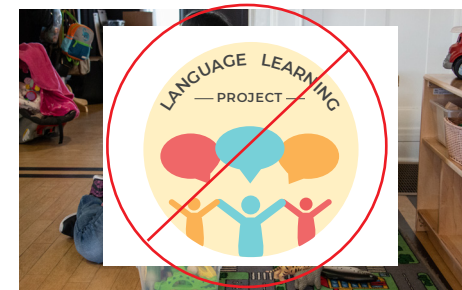
DON'T contain the logo in a box when used on a colored background