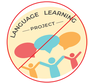
DON'T stretch, skew, or rotate the logo