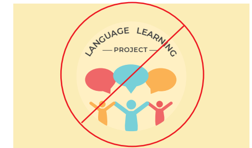
DON'T place the logo on a background that contrasts poorly